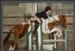
A PENNY FOR YOUR THOUGHTS 2011 14.2 MARE