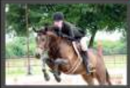
ON A WHIM 2011 14.1 GELDING