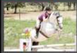
BLUE MY SOX OCT 2010 16.3 MARE