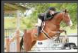
DETAILS REQUIRED 2014 16.1 GELDING