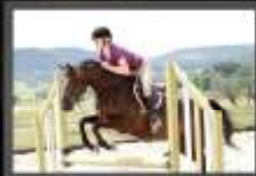
TIGER LILY 2010 15.1 MARE